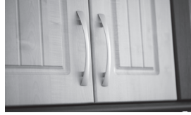
1 c _ _ p b _ _ _ r d