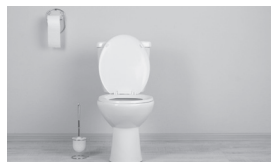
11 t _ _ _ l _ _ t

2 Tick (✓) or cross (X) the furniture for each room.