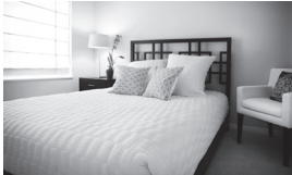
4 b _ _ d