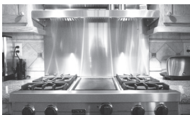
10 c _ _ _ k _ _ r