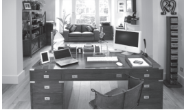
d _ e _ s k