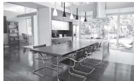
3 t _ _ b l _ _