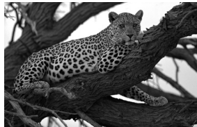
1 l _ _ _ p _ _ rd