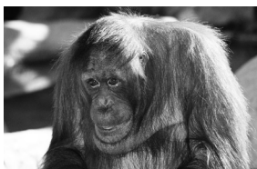
8 _ _ r _ _ ng- _ _ t _ _ n