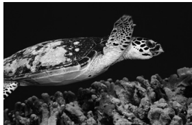
2 t _ _ rtl _ _