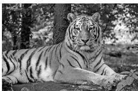
4 t _ _ g _ _ r