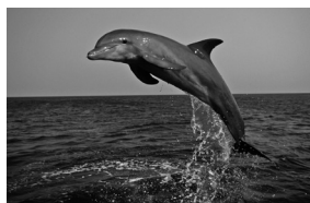
5 d _ _ lph _ _ n