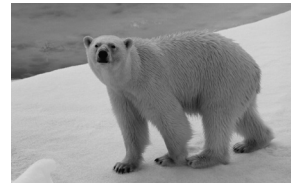
3 p _ _ l _ _ r b _ _ _ r