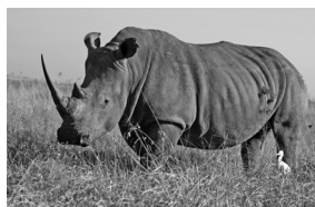
9 rh _ _ n _ _ c _ _ r _ _ s