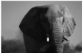
e l e ph a nt

3 Look at the pictures and complete the words with vowels.