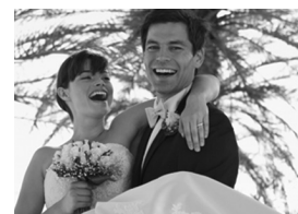
3 get _____