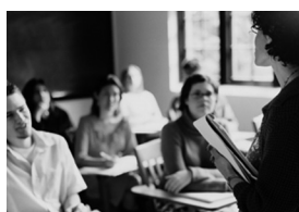
5 go to _____