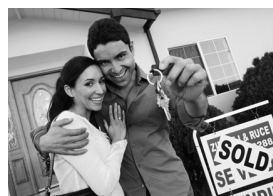
2 buy a _____