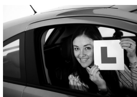
4 learn to _____