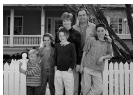
1 have _____