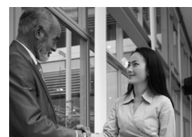
7 get a _____

2 Complete the text with the correct form of the phrases in exercise 1.