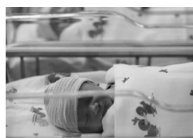
6 be _____