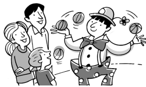
1 My uncle is selfish / funny.