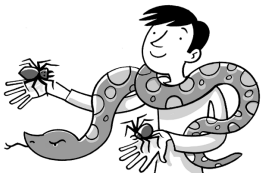
My brother is brave / shy.

2 Look at the pictures and circle the correct words.