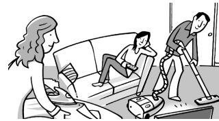
2 My parents say I'm lazy / cruel.