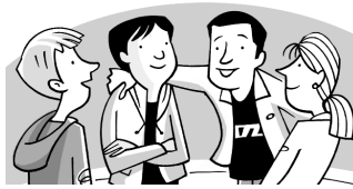
4 My best friend is friendly / stubborn.