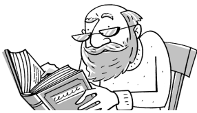
3 My grandad is loyal / wise.